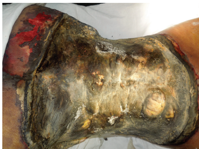
[Table/Fig-1]: Preoperative picture of the patient with necrotizing fasciitis of the back.

Postoperatively patient had fever, metabolic acidosis and persistent elevation of leukocyte count. She also had new onset septic encephalopathy. Blood culture grew E.coli and candida . Urine culture was sterile. Intra-operative tissue culture grew muco and patient was started on Amphotericin B. This patient continued to deteriorate and she had progression of the necrosis on the margins of the wound despite all the measures. Patient was taken for second session of debridement. Patient continued to worsen and there was onset of septic shock. This female developed multiple organ dysfunction syndrome over a period of few days. In spite of all these measures patient succumbed to her illness secondary to gram negative as well as fungal sepsis.