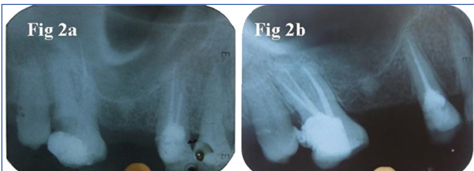
[Table/Fig-2]: a) Preoperative radiograph showing fractured instrument external beyond apex of mesiobuccal root of maxillary second molar, b) Postoperative radiograph during follow up.

patient with fractured endodontic instrument beyond apex of mesiobuccal root of maxillary second molar through maxillary sinus. An endodontic procedural error led to instrument fracture at the apex of mesiobuccal root of maxillary second molar. This caused low grade periapical inflammation leading to dull constant pain in the patient. It was imperative to retrieve the fractured fragment as it had perforated the sinus membrane to reach the sinus. The retrieval of fragment was achieved by gentle lifting of the sinus membrane. As the perforation was only a pinpoint perforation by the instrument