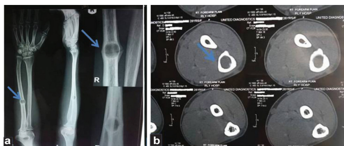
[Table/Fig-1]: a) X-ray forearm (preoperative): showing a clearly demarcated osteolytic lesion with sclerotic margins involving the cortex and medulla of mid diaphysis of right ulna; b) CT forearm— showing a well circumscribed expansile hypodense lesion in mid diaphysis of right ulna.

Xanthoma of bone is a benign bone disorder which occurs due to abnormal deposition of cholesterol in bone [5]. Usual age of presentation is around 20 years with male preponderance [6]. Xanthoma typically occurs in hyperlipidemic patients due to dysregulated macrophage sterol flux or disturbed macrophage