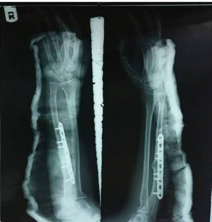
[Table/Fig-3]: X-ray forearm (postoperative): showing fracture fixation by internal fixator.

sterol reflux. Normolipemic xanthomas are either idiopathic or associated with abnormal apoprotein, lymphoproliferative disorders or they are post-traumatic [4]. On x-ray imaging, skeletal xanthomas appear as osteolytic lesion with cortical expansion or disruption and thus mimic primary bone tumours and metastatic deposits [7]. So, final diagnosis depends mainly on histopathology.