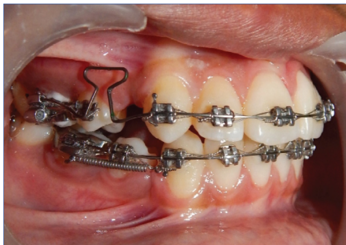
[Table/Fig-1]: Photograph showing en-masse retraction with T-loop in maxillary arch and closed coil spring in mandibular arch.

Computed Tomography was used for evaluating the changes in the root resorption before and after the retraction of anterior teeth. All the CT scans were carried out by a single experienced radiologist using the same tomographer.