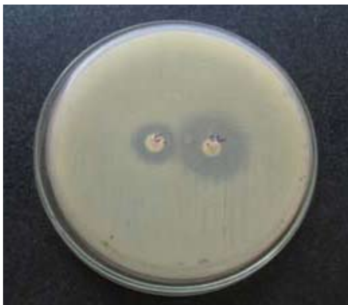
[Table/Fig: 2] D test negative isolate. Resistant to erythromycin and sensitive to clindamycin