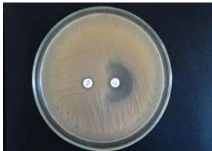
[Table/Fig: 1] D test positive isolate, inducible resistance to Clindamycin

D Positive (iMLSB Phenotype): Inducible resistance to Clindamycin was manifested by flattening or blunting of the CL zone adjacent to the ER disc, giving a D shape. [Table/Fig 1]