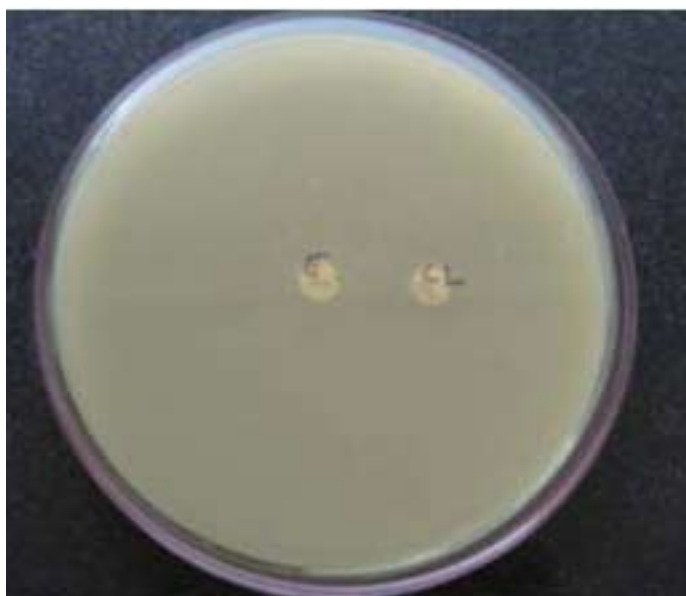
[Table/Fig: 3] Constitutive resistance to clindamycin