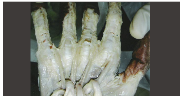
[Table/Fig 2]: 3rd Lumbrical inserted on ulnar side of middle finger

Another study which was done by Kurzumi M (2002) revealed that the lumbrical muscles originated from the intermediate tendon of the deep layer of the flexor digitorum superficialis for the index finger [5]. [Table/Fig 2]