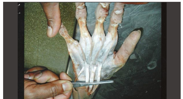
[Table/Fig 1]: 3rd Lumbrical showing split insertion

dons and that the third and fourth lumbricals originated from a single tendon instead of two [4]. [Table/Fig 1]