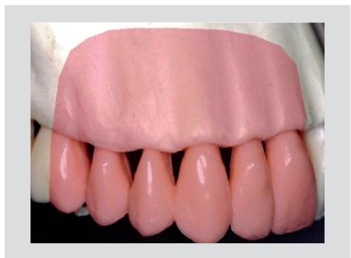
[Table/Fig-2]: Anesthetic range of AMSA injection