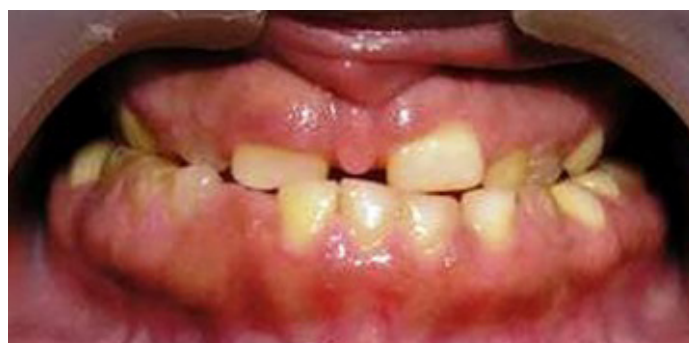
[Table/Fig-1]: Hypoplastic teeth with anterior cross bite

In both the cases, aesthetics, phonetics and mastication were the aspects of concern for the patients. In case I, encouraging proper oral hygiene practice; extraction of over retained primary teeth and 37; use of stainless steel crowns for restoring the vertical dimension in relation to 26, 36, 46; replacing missing teeth with removable partial dentures; providing palliative treatment for sensitivity (use of desensitizing pastes) and an orthodontic opinion were planned. In case II, along with the thorough oral hygiene measures, extraction of mobile primary teeth and 36 was advocated. To improve the functional ability, removable partial dentures were planned in relation to the impacted /missing teeth. As none of the impacted teeth were symptomatic a conservative approach (not to extract) was planned. However, the patient was kept under follow up, to evaluate any pathological changes which were associated with impacted teeth.