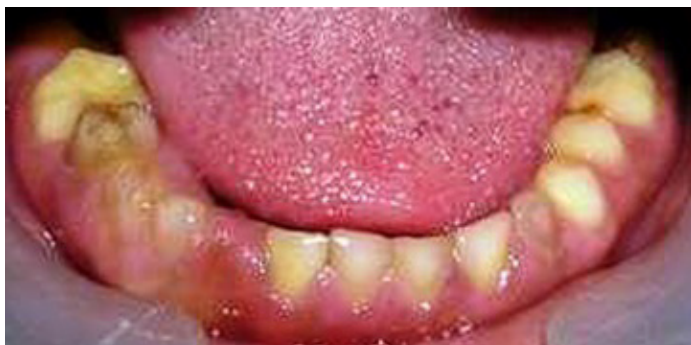
[Table/Fig-2]: Retained deciduous teeth