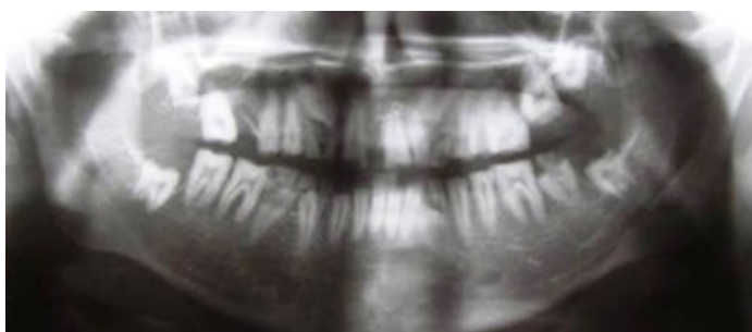
[Table/Fig-3]: OPG revealing impacted permanent teeth