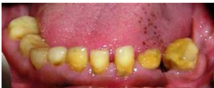
[Table/Fig-5]: Retained deciduous teeth