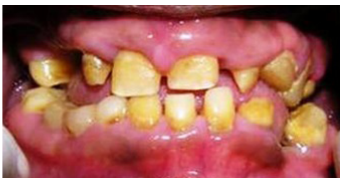
[Table/Fig-4]: Hypoplastic teeth with anterior cross bite and inflammatory gingival enlargement