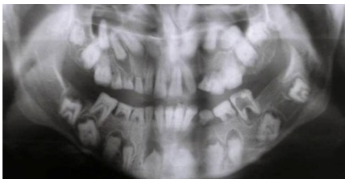
[Table/Fig-6]: OPG showing multiple impacted teeth with pericoronal radiolucencies