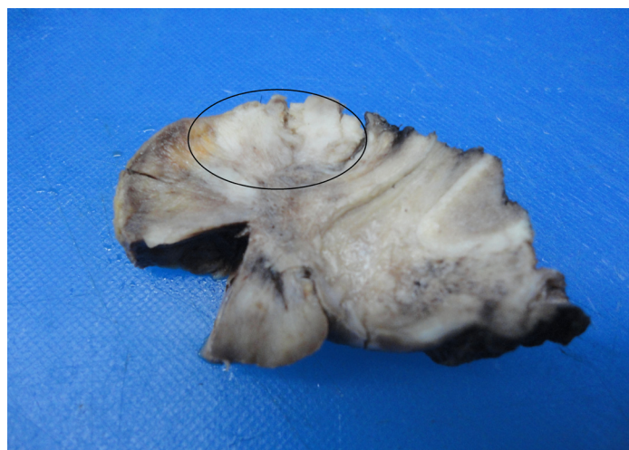
[Table/Fig-1]: Macroscopic view of the excised tumor (encircled). Note that the urethra is uninvolved by the tumor