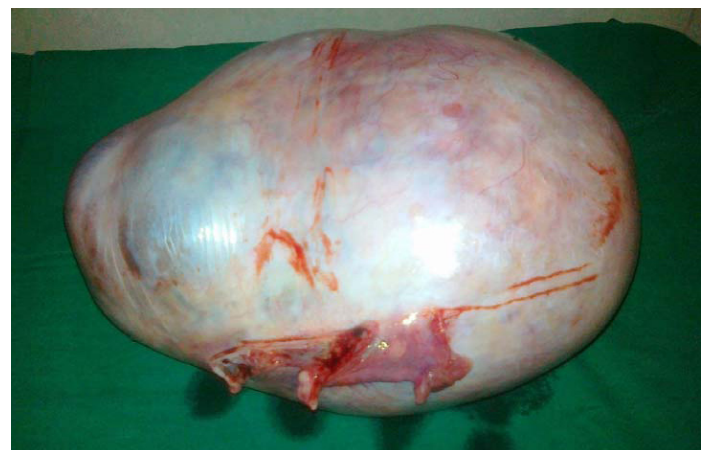
[Table/Fig-1]: Large tumour with thick capsule and smooth outer surface

The patient got her next period spontaneously after 1 month and