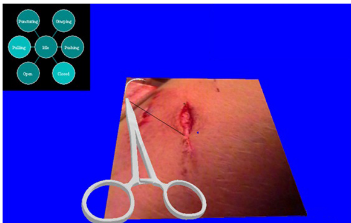
[Table/Fig-5]: Haptic suturing