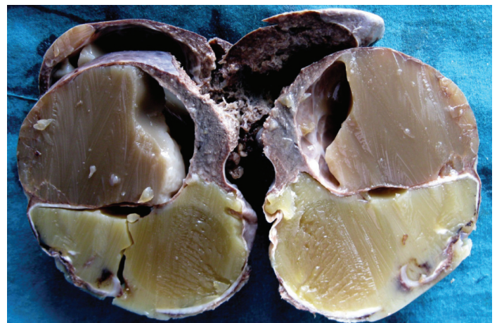
[Table/Fig-1]: Multiloculated splenic cyst filled with mucinous material

Splenic cysts are rare, with an incidence of 0.07%. Fowler, after an extensive review of world literature, proposed first pathological classification in 1953 [2]. This was thought of as a complex method and later, Martins proposed a simpler and a more practical clinical version, which became popular [3]. Cysts may be parasitic (75%)