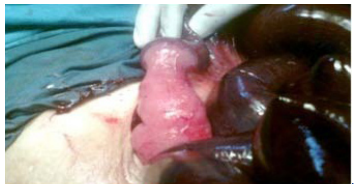
[Table/Fig-3]: Small bowel gangrene sparing 10cm of terminal ileum

18 months and we have not found any features of short bowel syndrome.