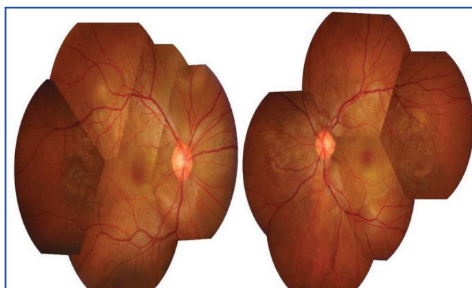
[Table/Fig-1]: Montage fundus photo showing bilateral hyperemic discs with multiple serous retinal detachments

The patient was diagnosed as an incomplete case of VKH syndrome and he was started on oral prednisolone (75 mg/day) for 1 week,