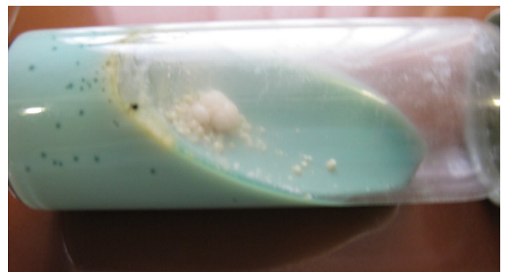
[Table/Fig-2]: Growth on Lowenstein Jensen medium