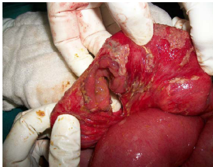
[Table/Fig-4]: Perforated bowel loop