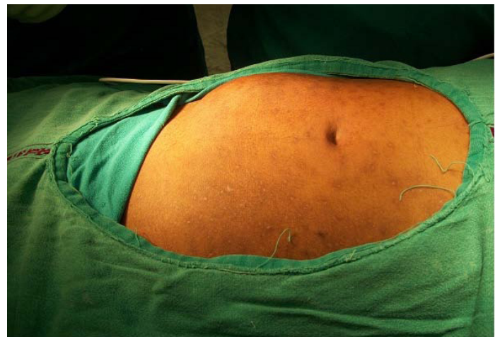
[Table/Fig-1]: Parietal wall swelling

A 38-year-old male patient presented in the emergency department with complain of painful swelling in the right lower abdomen. Patient met injury to the right lower abdomen following fall from a tree three days back. He also complained of non-passage of stool and flatus for one day. On general examination, patient had tachycardia (pulse-110/min). On local examination, tender irreducible parietal swelling of size 10×10 cm [Table/Fig-1] was present in the right lower abdomen with no expansile cough impulse. There was edema and local rise of temperature in the overlying skin. X-ray abdomen was suggestive of multiple air fluid levels with dilated small bowel loops. Ultrasound abdomen revealed edematous bowel loops and heterogeneous fluid collection in the parietal layer in the right lower abdomen. CECT abdomen showed a 2.1 cm defect [Table/Fig-2] in the transverse abdominis muscle at the level of arcuate line, herniation of small bowel loops and surrounding mesentery and the presence of subcutaneous emphysema. On exploratory laparotomy, a 2×3 cm defect [Table/Fig-3] was noted in the parietal layer in the right lower abdomen with herniation of ileal loop. Herniated bowel loop was gangrenous and perforated [Table/Fig-4] and there was spillage of fecal matter into the adjoining necrosed parietal layer. Gangrenous bowel loop was resected and ileostomy was performed. Necrosed parietal layer was debrided. Post-operative course was uneventful and ileostomy was closed after 6 weeks.