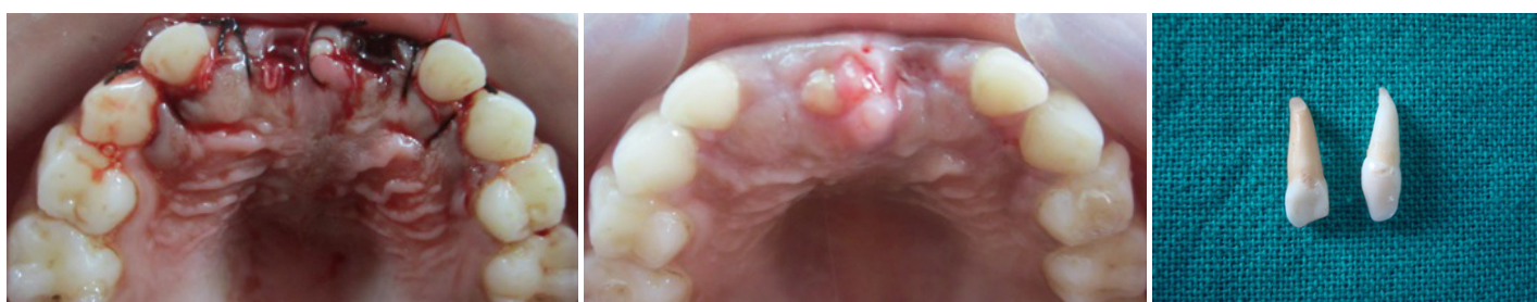
[Table/Fig-4]: Sutures placed [Table/Fig-5]: Postoperative healing [Table/Fig-6]: Extracted teeth