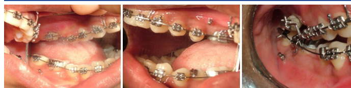
[Table/Fig-6a,b,c]: Micro-implants placed at various locations