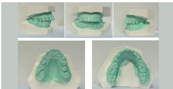
[Table/Fig-2b]: Pre-treatment study model