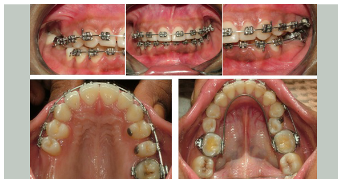
[Table/Fig-5]: Before placing implants