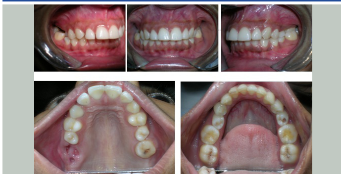
[Table/Fig-2a]: molars except 27 in upper arch