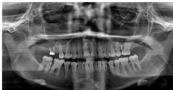
[Table/Fig-11]: OPG showing placement of implants at various sites

Lower molar intrusion- As suggested by Seong Min et al., [7] the lower right first molar (46) was intrude by generating an intrusive force tied between implant and arch wire thereby giving a more