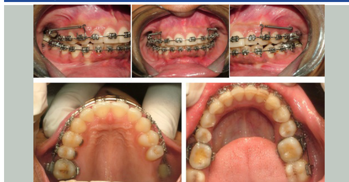
[Table/Fig-7]: During treatment