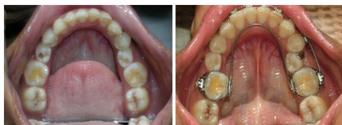
[Table/Fig-4]: Showing constricted lingual arch correcting cross bite on lower 1st molars