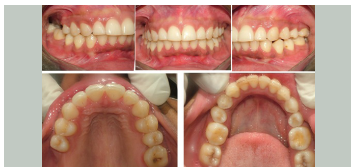
[Table/Fig-8]: Post-treatment intra-oral photographs