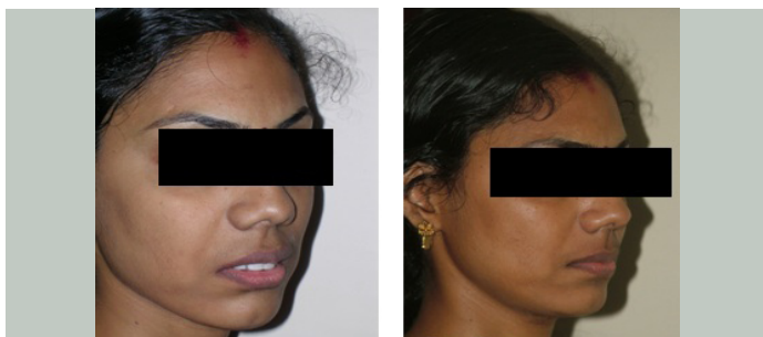
[Table/Fig-1d]: Oblique Pre-treatment and Post treatment