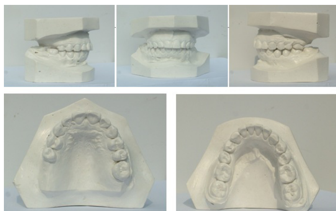
[Table/Fig-12]: Post-treatment study models

clearance for placing prosthodontic implants in future [Table/Fig-12]