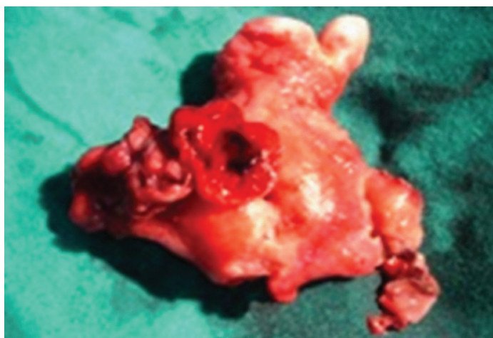
[Table/Fig-1]: Specimen of uterus, tube and ovaries showing blood clots and attached right ovary over posterior surface of uterus

Our case fulfilled all the four criteria of Spiegelberg (1878) for the diagnosis of ovarian pregnancy: (a). The tube has to be entirely normal (b). The gestational sac has to be anatomically situated in the