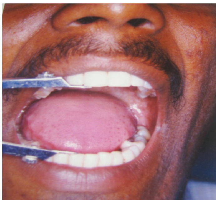
[Table/Fig-2]: Measurement of interincisal distance in a patient of OSMF