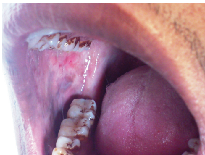
[Table/Fig-1]: Blotchy marble like pallor of buccal mucosa in a patient of OSMF

The statistically significant decreased assay levels observed in Arginine, Leucine in all the study groups of OSMF (I,II and III); the increased assay level of lysine in group I and decreased assay level in group II and group III when compared to the control group shows promise as disease markers [Table/Fig-7].