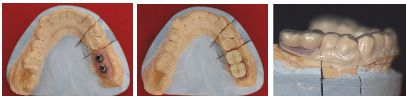
[Table/Fig-1]: Working cast with abutments [Table/Fig-2]: The PFM crowns seated on the abutments [Table/Fig-3]: Clear vacuum formed sheet adapted onto the cast

The advantage of screw retained versus cement retained prosthesis has been a topic of debate over a period of time. However, due to ease in fabrication, improved esthetics, occlusion, passivity, reduced cost of components and easier access in the posterior region, cement retained restorations have gained popularity. Long term clinical data has reported cement retained restorations to be more successful biologically and functionally than screw retained restorations [1]. Various complications with screw retained prosthesis have been reported in the literature which include: fracture of ceramic, compromised esthetics and interference in establishing occlusion due to access screw opening [1,2]. The most commonly encountered prosthetic complication of implant supported restorations is screw loosening [3,4].