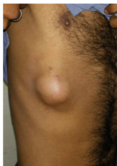
[Table/Fig-1]: Lump on right chest wall over 9 th and 10 th intercostal space

Routine hematological investigations revealed haemoglobin as 12 mg%, total leucocyte count (TLC) was 14,000/ cu mm [polymorphs 80%, lymphocytes 20%] and platelet count of 2.6 lac/cu mm. Erythrocyte sedimentation rate (ESR) was 45 mm in 1 st hour. Fasting blood sugar was 81mg%. Serum electrolytes, thyroid function tests, liver function tests and kidney function tests were within reference range. Peripheral blood smear showed mild anisopoikilocytosis. Anti-HBsAg, anti-HCV, HIV1 and 2 antibodies were non-reactive.