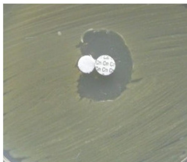
(Table/Fig 3) AmpC disc test: showing flattening of zone of inhibition

inactivation of cefoxitin were taken as negative for AmpC production [14].