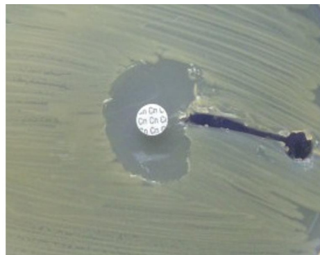
(Table/Fig 2) MTDT test: showing clear distortion of zone of inhibition

[Table/Fig 2]. Isolates with no distortion of zone of inhibition was taken as AmpC nonproducers. Isolates with minimal distortion was taken as indeterminate strains.