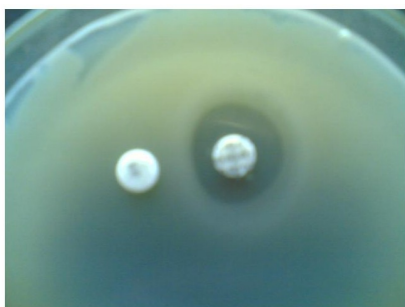
(Table/Fig 1) Disc antiagonism test:Showing blunting of Cefotazidime zone of inhibition adjacent to Cefoxitin disc

In this test, lawn culture of test isolate (0.5 Mc Farland) was put over Muller-Hinton agar plate (MHA) and ceftazidime (30 \mu g) and Cefoxitin (30 \mu g) disc were placed 20mm apart from centre to centre. Plates were incubated for 18-20 hours at 37° C. AmpC \beta -lactamase inducibility was recognized by isolates showing blunting of ceftazidime zone of inhibition adjacent to cefoxitin disc and were considered screen positive [12][Table/Fig 1] .