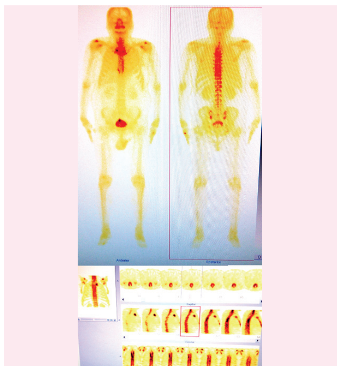
[Table/Fig-1]: Radionuclide (99m Tc – MDP) Bone scan showed skeletal metastases involving D12 vertebra and right Ischium with degenerative changes of few other areas

deprivation therapy (ADT) and he opted for surgical castration. He underwent bilateral orchiectomy and histopathology reported to be metastatic adenocarcinoma of right testis [Table/Fig-2] and the resection margin of right spermatic cord showed lymphovascular invasion [Table/Fig-3]. The other testis was absolutely normal. His serum PSA started falling, 134.84 ng/ml after 1 month of