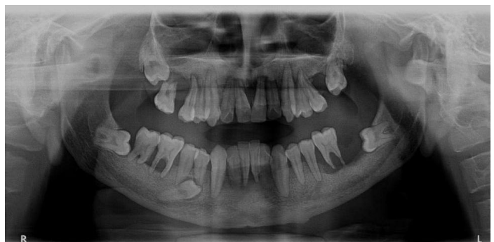
[Table/Fig-6]: Orthopantomogram displaying hypoplasia of mandibular ramus, generalised atrophy of maxillary and mandibular alveolar bone with absence of a few permanent molars.

showed decreased bone density with anterior bowing of tibia as well as transverse metaphyseal and diaphyseal bands [Table/Fig-5].