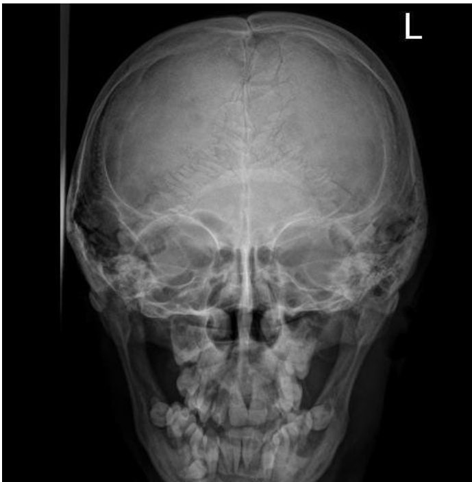
[Table/Fig-3]: Skull radiograph displaying findings of multiple wormian bones along the lambdoid suture and non-fusion of the coronal and lambdoid suture