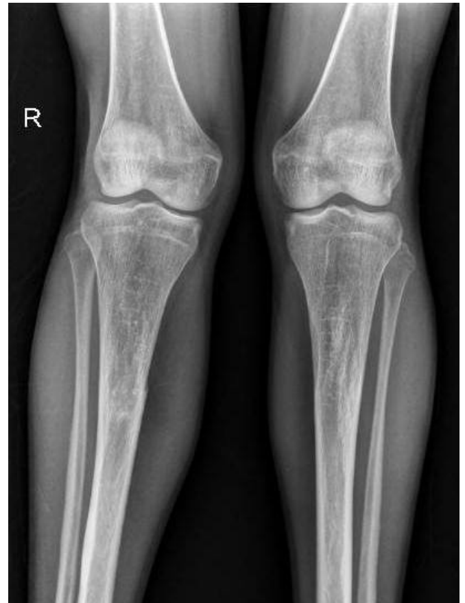
[Table/Fig-5]: Radiograph of the leg showing decreased bone density with anterior bowing of tibia as well as transverse metaphyseal and diaphyseal bands