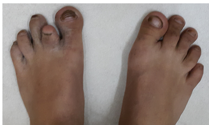
[Table/Fig-2b]: Feet showing discoloured toes, short left 2 nd toe and the dysplastic nails

The biochemical investigations included serum calcium 9.5 mg/dL (8.3–10.4), phosphorus 3.3 mg/dL (2.5– 4.6) serum creatinine 0.9 mg/dL (0.5– 1.4 ), total alkaline phosphatase 144 U/L (40–125 U/L), serum parathyroid hormone 47.7 pg/mL (8–72 pg/mL) and 25 hydroxyvitamin D 22.8 ng/mL (30–75 ng/mL).