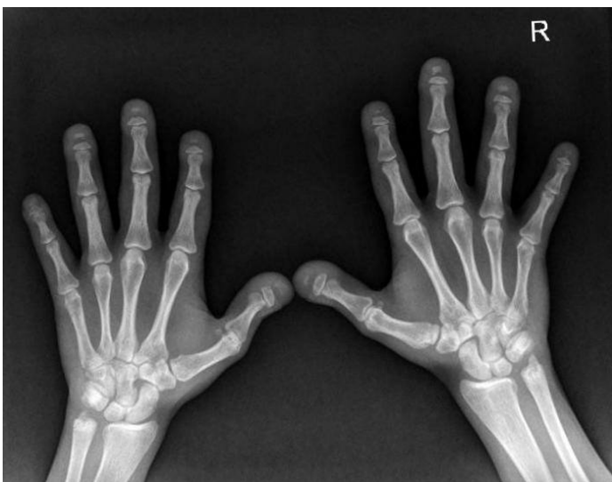
[Table/Fig-4]: Hand radiograph showing terminal acroosteolysis with normal bone density.