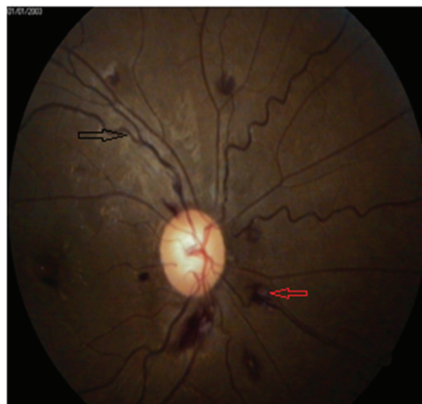
[Table/Fig-1]: RE fundus photograph showing white-centered haemorrhages (leukaemic infiltrations) and segmental perivascular white infiltrates.

Thereafter patient was referred to Oncology Department of Civil Hospital, Ahmedabad for bone marrow biopsy. Bone marrow biopsy showed hypercellularity with increased myeloid to erythroid ratio along with megakaryocytosis. It did not reveal any fibrosis and blast percentage was 4%. The cytological examination along with the morphologic features confirmed the diagnosis of CML. Patient was started on oral Imatinib (800mg). After 2 months course of imatinib, her best corrected visual acuity in left eye improved to 6/18 and haemorrhages resolved significantly in BE. OCT macular analysis indicated normalization of macular thickness in left eye.