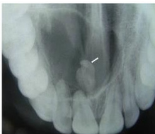
(Table/Fig 2) Occlusal radiograph showing a unilocular radiolucent lesion (case 1)