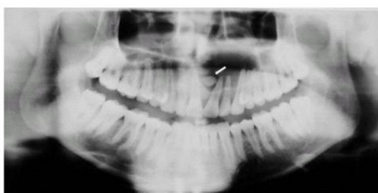
(Table/Fig 6) Panoramic radiograph (case 2)