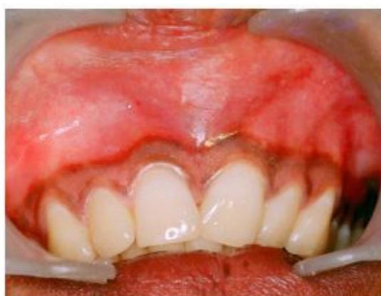
(Table/Fig 5) Clinical picture with swelling in the mucobuccal fold between the maxillary central incisors (case 2)

positioned mesiodens between the maxillary central incisors. Displacement of the roots of the maxillary left incisors and the canine was clearly evident, resulting in a change in their axial inclination. No evidence of the resorption of the roots was seen ( Figures 6-8 ) [Table/Fig 4]. Clinical and radiographical findings were suggestive of dentigerous cyst. Routine haematological investigations were normal. The mesiodens was surgically extracted and the cystic lining was enucleated under local anaesthesia. The post operative healing was uneventful. The patient was under follow-up for six months and presented no complications. Histopathological examination of the specimen confirmed the diagnosis of a dentigerous cyst.