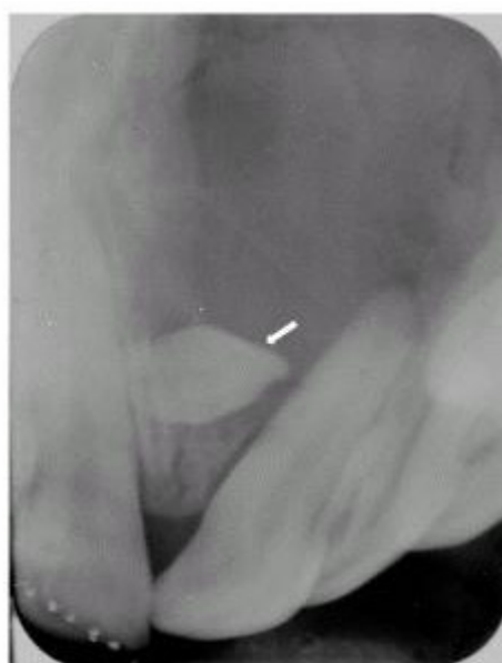
(Table/Fig 8) Periapical radiograph (case 2)