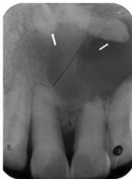
(Table/Fig 11) Periapical radiograph (case 3)

37 and 28 were severely decayed. Generalized moderate to severe calculus and stains were noticed. The maxillary left central and lateral incisors were not carious and did not respond to vitality tests. A provisional diagnosis of a radicular cyst in relation to the maxillary left central incisor was made. On further investigation, the radiographs revealed a large radiolucent area in the anterior maxilla, involving one of the two impacted supernumerary teeth (mesiodens) with short roots and were suggestive of a dentigerous cyst. Further, root resorption of 21 and 22 was evident (Figures 10-11) [Table/Fig 6]. Routine haematological and biochemical tests were normal. Maxillary left incisors [21],[22] were endodontically treated and were obturated with gutta-percha. Then, under general anaesthesia, surgical extraction of the impacted supernumerary teeth and enucleation of the cyst was done, followed by retrograde filling of 21 and 22 with mineral trioxide aggregate. The post operative course was uneventful. The histological examination of the specimen was suggestive of a dentigerous cyst.