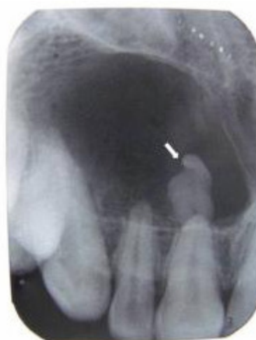
(Table/Fig 3) Periapical radiograph (case 1)

examination included panoramic, occlusal and periapical radiographs which showed an impacted supernumerary tooth (inverted mesiodens) with a short root apical to the maxillary right central incisor which was associated with a well defined unilocular radiolucent area in the anterior region of the maxilla. Displacement of the roots of the maxillary right lateral incisor and the canine was evident ( Figures 1-3 ) [Table/Fig 1]. After clinical and radiographical examination, a diagnosis of dentigerous cyst involving an impacted mesiodens was made. Routine haematological investigations were normal. Extraction of the mesiodens and surgical enucleation of the cyst was done under local anaesthesia. Histological examination of the specimen confirmed the diagnosis of a dentigerous cyst ( Figure 4 ) [Table/Fig 2]. The patient was under follow-up for 6 months and presented no complications.