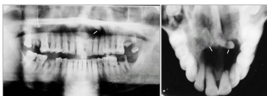
(Table/Fig 10) Panoramic and occlusal radiographs showing two supernumerary teeth and a cystic lesion in case 3