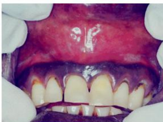
(Table/Fig 9) Clinical picture of midline swelling in maxillary arch in (case 3)