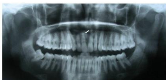
(Table/Fig 1) Panoramic radiograph showing radiolucent lesion involving an inverted supernumerary apical to maxillary right central incisor (case 1)