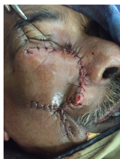
[Table/Fig-3]: Wide local surgical resection of pigmented basal cell carcinoma. [Table/Fig-4]: Raw area was covered with Limberg flap.