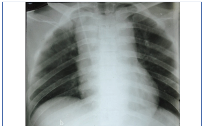
[Table/Fig-1]: Portable radiograph depicting widened mediastinum.

A primary diagnosis of cardiac tamponade was considered and urgent cardiac surgery consultation was sought. The patient was intubated in view of progressive hypotension. On reassessment, air entry was reduced bilaterally, hence, bilateral intercostal drains were inserted and pneumothorax was drained bilaterally. Subsequently, air entry improved bilaterally. CVP persisted to be 20cm of H 2 O and patient continued to be hypotensive. Blind pericardiocentesis was attempted unsuccessfully. Patient was shifted into the operation theatre and subxiphoid pericardial window revealed a bulging pericardium. Diagnostic Peritoneal Lavage (DPL) was also done which showed haemoperitoneum. Median sternotomy was done and 250ml of clots and blood was evacuated on opening pericardium, following which BP showed an upward trend. A 0.5 cm actively bleeding rent was identified on right atrial appendage [Table/Fig-2]. The rent was closed with 5-0 polypropylene suture in two layers. Laparotomy was done and 600ml haemoperitoneum was evacuated. Splenectomy was done for grade four laceration. Large non-expanding pelvic and retroperitoneal hematoma and a small non-bleeding liver laceration were left untouched. Patient was transfused four units of blood and fresh frozen plasma each. Patient made an uneventful recovery. A postoperative TTE showed no abnormality. Patient also had a tibial spine avulsion fracture