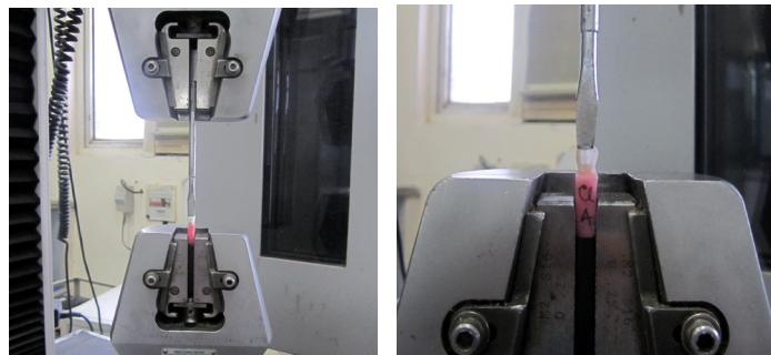
[Table/Fig-3]: Universal testing machine with mounted specimen.

Score 1 = less than half the bonded area covered by the adhesive