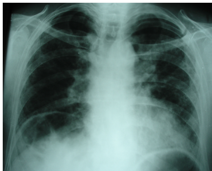
[Table/Fig-1]: Chest radiograph showing bilateral reticular pattern of lung parenchyma and hypertranslucent shadow with colonic haustral pattern below the right diaphragm.

Patient was started on inhaled bronchodilators, intravenous anti-biotics, diuretics, perfenidone and symptomatic treatment for ILD.