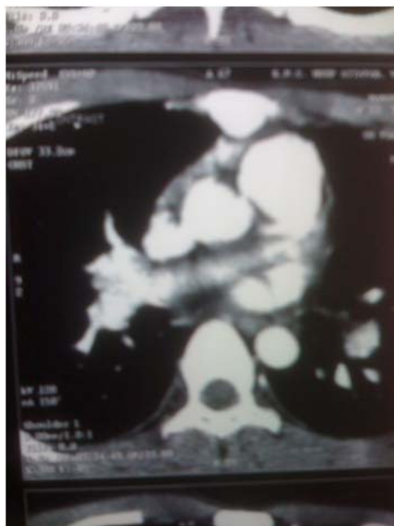
[Table/Fig 3b]: CECT -CHEST Pulmonary artery thrombosis of left lower lobe segmental and interlobar artery

The acquired causes of protein C and S deficiencies are seen in acquired illnesses like liver disease, DIC, therapy with L-asparaginase and coumarin and acute severe bacterial infections, etc. The homozygous variety is rare and these patients have neonatal purpura fulminans[2].