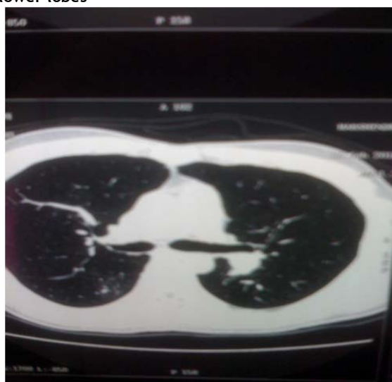
[Table/Fig 2] HRCT: Pleural thickening in the apical segment of left upper lobe and scattered ground glass attenuation in apical basal segment of both lower lobes

Based on these clinical findings and laboratory results, the patient was diagnosed to have chronic thromboembolic pulmonary artery hypertension with deep vein thrombosis due to protein S deficiency. The patient was started on warfarin 5mg daily and sildenafil 25mg daily.