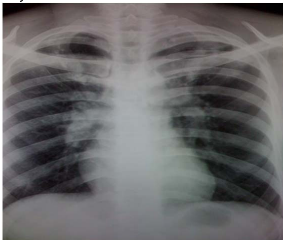
[Table/Fig 1] Chest X-ray: Dilatation of the pulmonary artery

The patient gave a history of chest pain, six weeks prior to the onset of the present complaints. The chest pain was of moderate intensity in the left lower chest, it was pricking in nature and lasted for 15 minutes. The pain was aggravated with respiration and was relieved spontaneously without medication. The chest pain was not radiating and was not associated with sweating, syncope, breathlessness or vomiting. There was no history of trauma/tuberculosis/asthma/hypertension/ diabetes mellitus/ ischaemic heart diseases/rheumatic or congenital heart diseases. There was no history of similar complaints in the past and also, no history of alcohol/smoking. The patient also gave a history of swelling in the calf, with pain 3 weeks prior to the onset of the present illness.