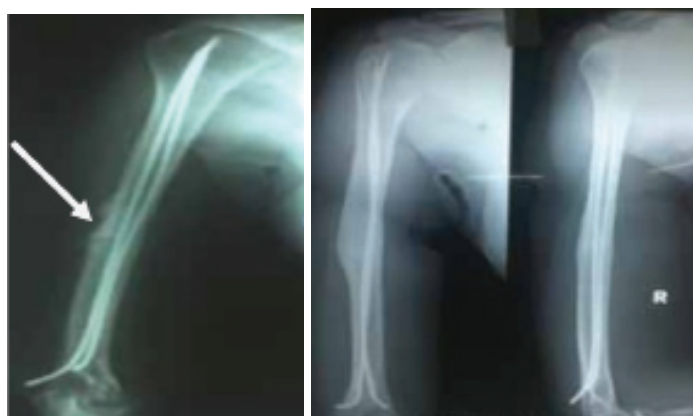
[Table/Fig-10]: Follow up X-ray at 12 weeks showing callus formation at fracture site. [Table/Fig-11] Follow up X-ray at one year showing complete union.

deltoid muscle and in retrograde manner; nail can be inserted via lateral and medial entry portals at the distal end of humerus [18]. Two nail can be inserted with lateral portals with entry point one at 1.5 cm superior and posterior to lateral epicondyle and another at 1.5 cm superior and posterior to the first entry point with nail either C or S shape configuration or two nail can be inserted with one at lateral first entry point and other from the medial side with entry point at 1.5 cm superior and posterior to medial epicondyle. But the lateral entry for two nails is more preferred over lateral and medial entry to prevent ulnar nerve injury. However, a medial and lateral entry point provides more stability but caution should be taken and should be done only after ulnar nerve exploration by a small incision.