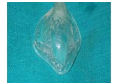
[Table/Fig 1]: Passive feeding plate Molding plates

designs which exert force to move the palatal segments to an ideal location.