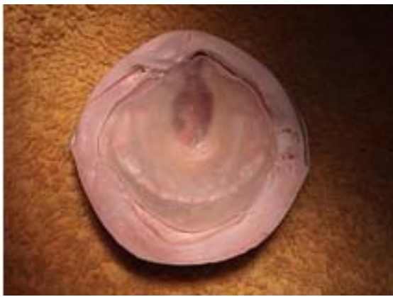
[Table/Fig 6]:Master cast with the feeding device