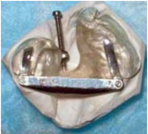
[Table/Fig 2]: Latham's appliance

The advantage of this device is that it allows the manipulation of the palatal segments to the desired location, thereby helping to bring the clefts together, thus making the cleft lip repair easier. The appliance however, does not provide an artificial palate as it does not cover the defect.