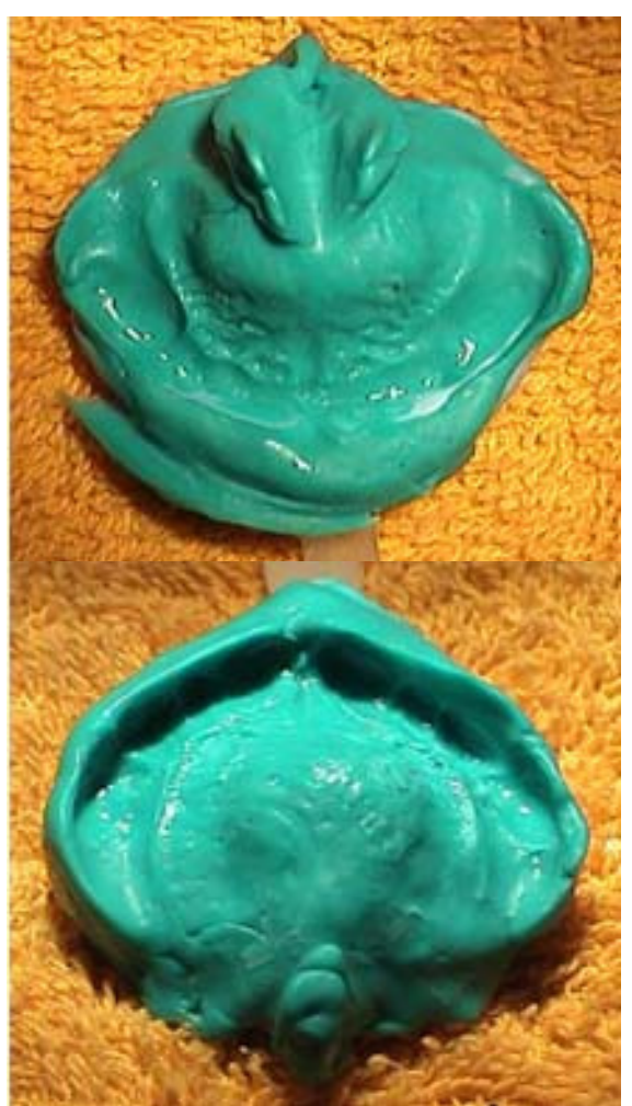
[Table/Fig 3], [Table/Fig 4]: Putty wash impressions to record palatal clefts in infants

After the making of the impression, a cast is prepared [Table/Fig 5] on which the feeding device can be fabricated in heat cure acrylic resin material [Table/Fig 6], by using a long curing cycle to minimize the leaching out of the residual monomer.